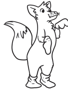
fox in socks