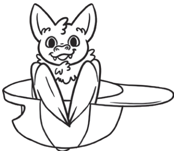
bat in a hat