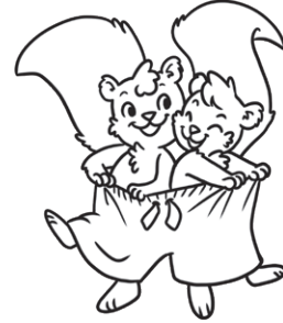
skunks in trunks