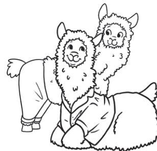
llamas in pyjamas