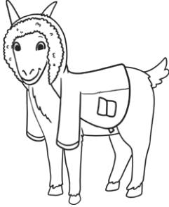
goat in a coat

Look at each picture. Write a rhyming caption for each one. The first one has been done for you.